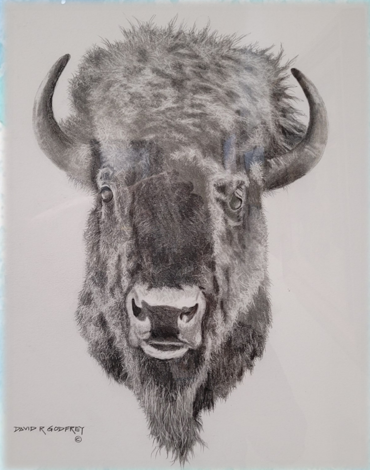
He Who Owns Us (Buffalo)