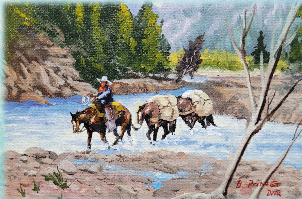
Headin' for High Country