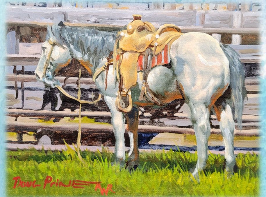
Lady in Waiting Oil 8"x10" $300