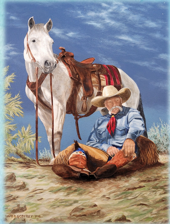
A Reminiscent Night