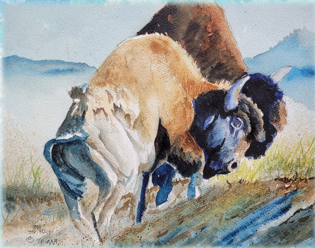
Whose Tread Makes the Earth to Rumble