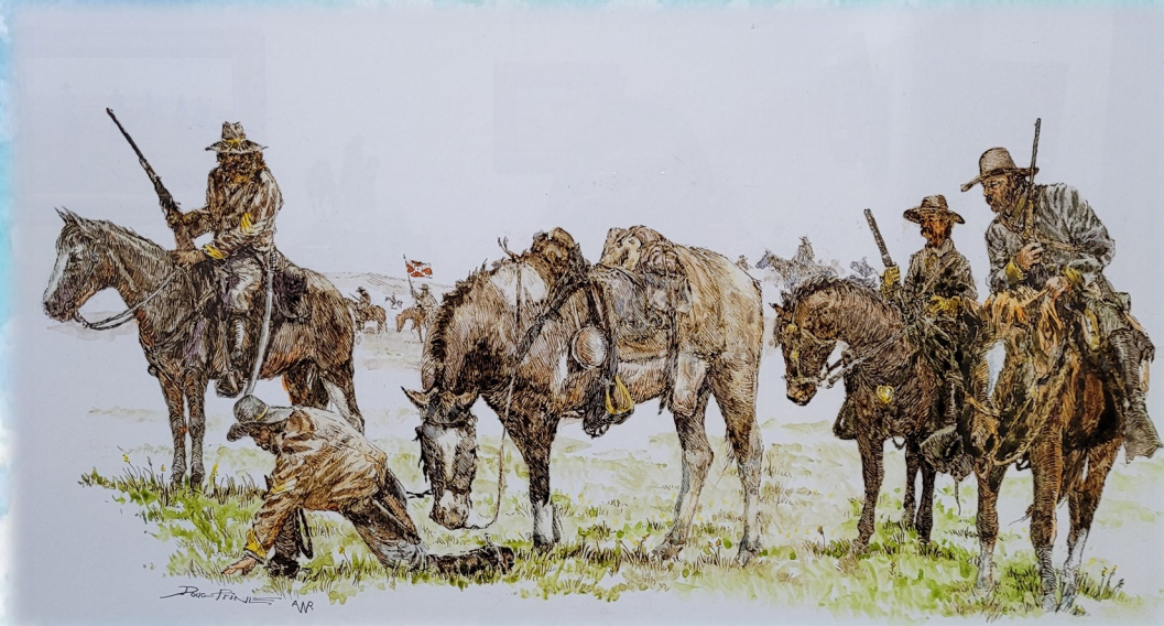
Terry's Rangers Pen & Ink w/ Watercolor 24"x36" $2,500