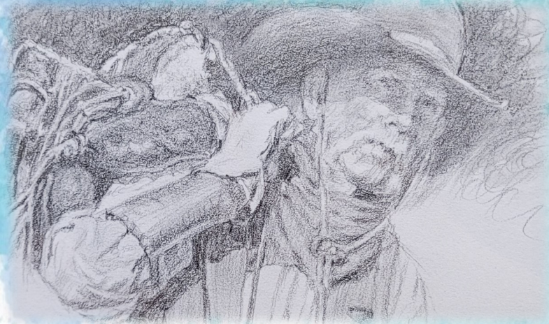
It's Been a Long Day