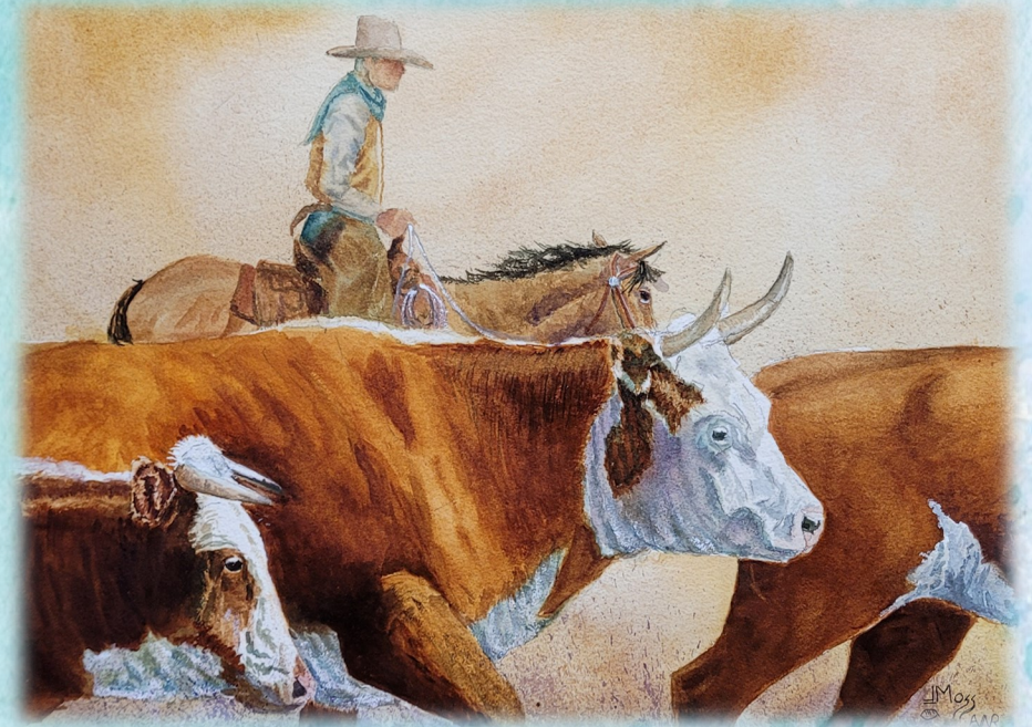
Till the Sun Has Come and Gone