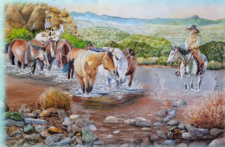
Rheata and Me