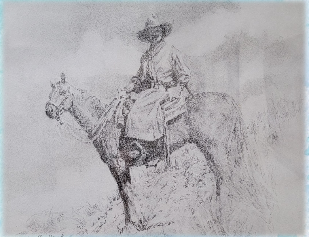
The Real Deal